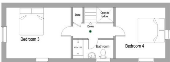
Proposed First Floor